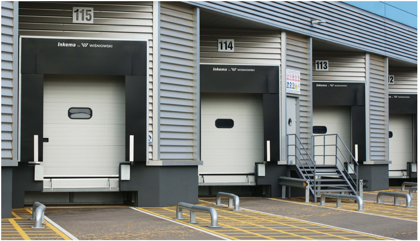
ABRE retractable dock shelter