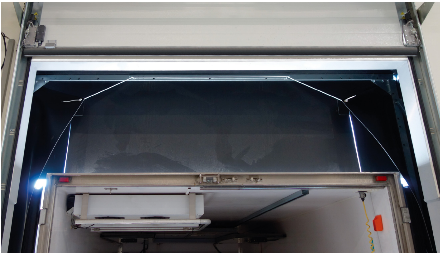
ABRE retractable dock shelter – as seen from the inside